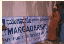
Home for disabled

A shelter for needy disabled women and children.