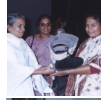
Donation of caliper

SERVICE TO HELP THEM REALISE THEIR DREAMS. Medical assistance, like surgery, providing calipers, wheelchairs, tricycles, crutches etc.