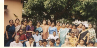
Margadarshi with inmates.