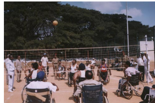
Sports meet for disabled.

Margadarshi's events aim to inspire them, set challenges for them, make them feel on par with everyone else.